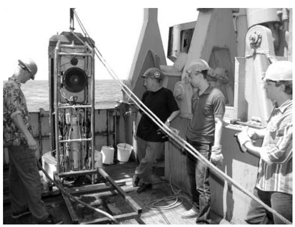
Training in equipment handling

The UNESCO Chair in Marine Geology and Geophysics (established at the Geology Faculty, MSU in 1994) continues to function as part of the UNESCO-MSU Centre for Marine Geosciences, providing educational support for its research projects. As was previously the case, particular attention was paid in 2002 to supervision of undergraduate, M.Sc. and Ph.D. projects based on data collected during the TTR expeditions. An important component of the Chair's activities was also the group training given to students selected for the participation in the TTR-12 cruise. Lectures and seminars, given on board the 'Floating University' by an international group of professional researchers (Annex III), contributed substantively to the overall success of the training programme.