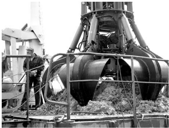
TV-grab on board the Logachev