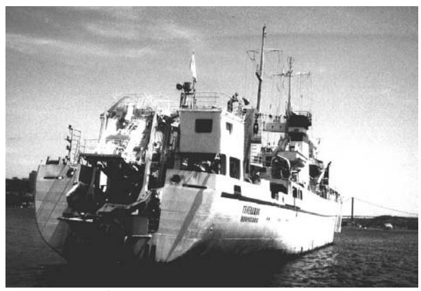
R/V Professor Logachev, the TTR 'floating university' ship: most of its heavy geological and geophysical equipment is operated from a specially designed stern

The Centre is the principal organizer of the TTR cruises: for the TTR-12 international cruise in 2002, as previously, it negotiated with Russia's Ministry of Natural Resources (the ship-owner) all the conditions for the use of the ship R/V Professor Logachev including its equipment and technical support staff. It also ensured training of some thirty MSU students and hosted six Ph.D. projects (including two international ones, from Portugal and the UK) within its laboratories at the Geology Faculty and Science Park. In addition to promoting research and training projects, it offers – either directly or through various arrangements – a considerable number of fellowships for research and training abroad to MSU scientists and students.