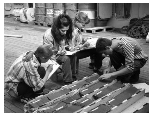
Students describing sedimentary columns

sampling of deep-water coral settlements in different locations, the discovery of exotic blocks of sandstones, igneous and metamorphic rocks on tops of some shallow-water mud volcanoes, and the mapping of the Jil Janesh deep-water sandy system using the 100 kHz side scan sonar and 5.1 kHz profiler.