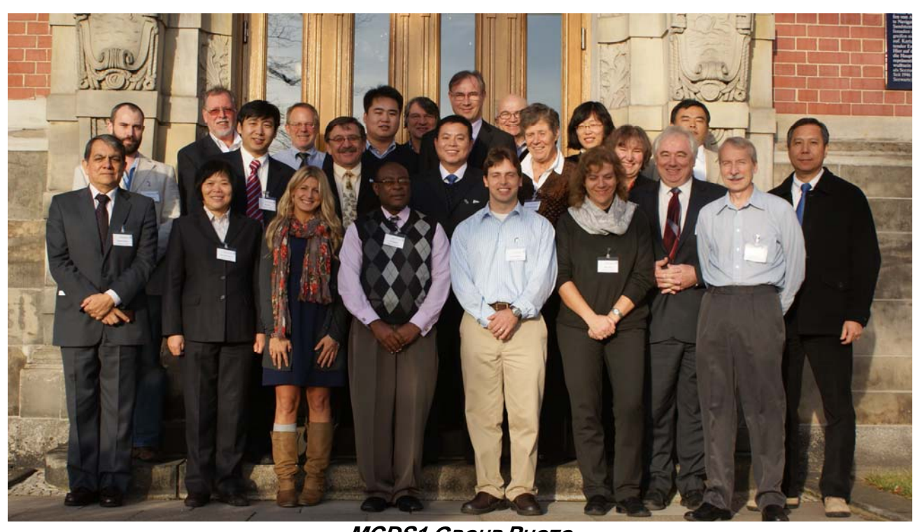
MCDS1 GROUP PHOTO