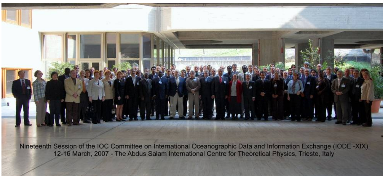
Group photograph of IODE-XIX participants