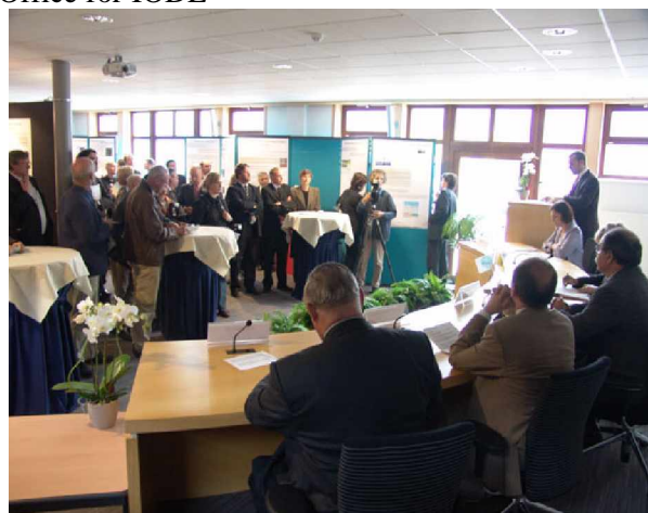
Addressing the Press in the Main Conference Room