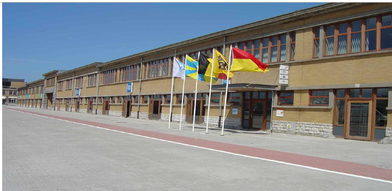
The IOC Project Office for IODE