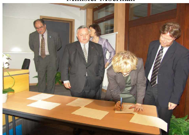
Minister Moerman signing the management agreement for the Office