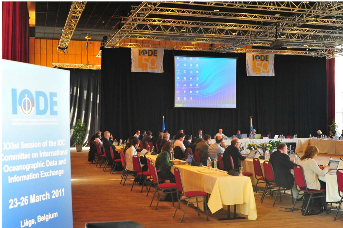
Figure 1: Venue IODE-XXI, Liège, Belgium