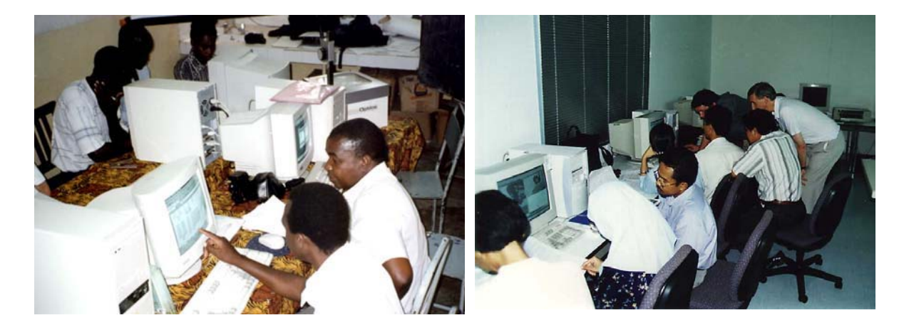
Fig. 2 Students at work using Bilko for Windows. (a) Course participants from mainland Tanzania, Zanzibar and Kenya work on Bilko Module 7 practical lessons at the Institute of Marine Sciences, Zanzibar (November 1997). (b) Course participants work on dedicated lessons designed for the IOCCG training course at the Asian Institute of Technology, Bangkok, Thailand (November 1999)

From the viewpoint of the Bilko Project it is clear that there is scope for mutually beneficial partnerships with these organizations for Bilko can contribute a strong record of teaching in remote sensing while the organizations can bring unparalleled expertise in particular aspects of remote sensing.